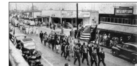
Military Parade marching down Third Street.

The Vernon Parish Veteran's Plaza was built to honor all Vernon Parish veterans. Since it was begun, the memorial has grown to contain seven stone tablets engraved with the names of Vernon Parish vets. At the site, the American flag towers above the flags of the five U.S. military branches, including Army, Air Force, Navy, Marines, and Coast Guard, as a POW flag flutters to the side, alone, but not forgotten.