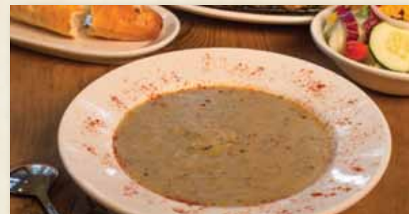
Oyster & Rockefeller Soup, Deanie's Seafood Restaurant

Oyster season is during months that end in -R (September - December).