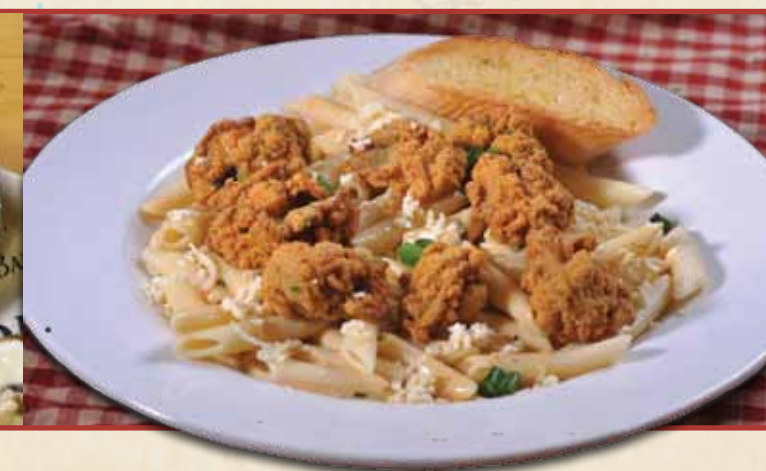
Oysters Acadiana, O'Henry's Food & Spirits