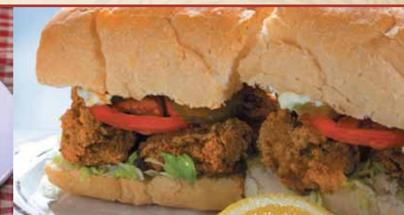
Fried Oyster Po-boy, Acme Oyster House