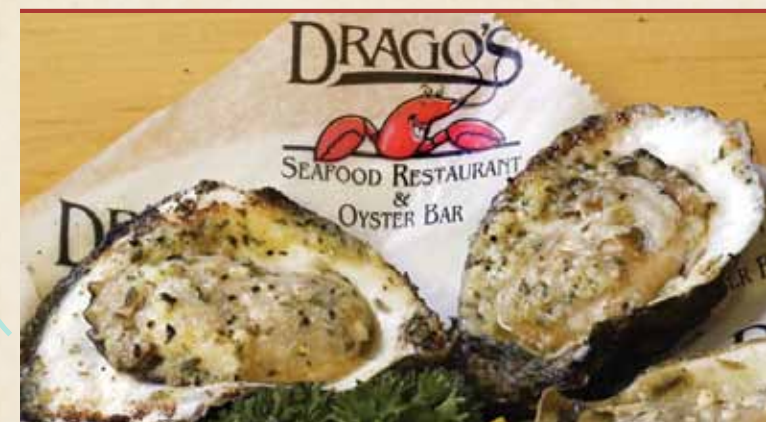
Charbroiled Oysters, Drago's Seafood Restaurant & Oyster Bar

There's one sure way to tell if an oyster is alive. If its shell is open, you tap on it with your fingers, and if it snaps shut, then it's alive.